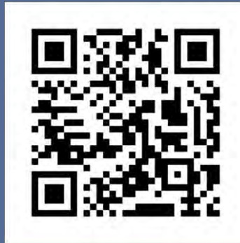
Reach Higher New Mexico Webpage