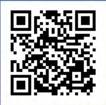
Main HED Webpage

Reach Higher New Mexico: https://www.reachhighernm.com/